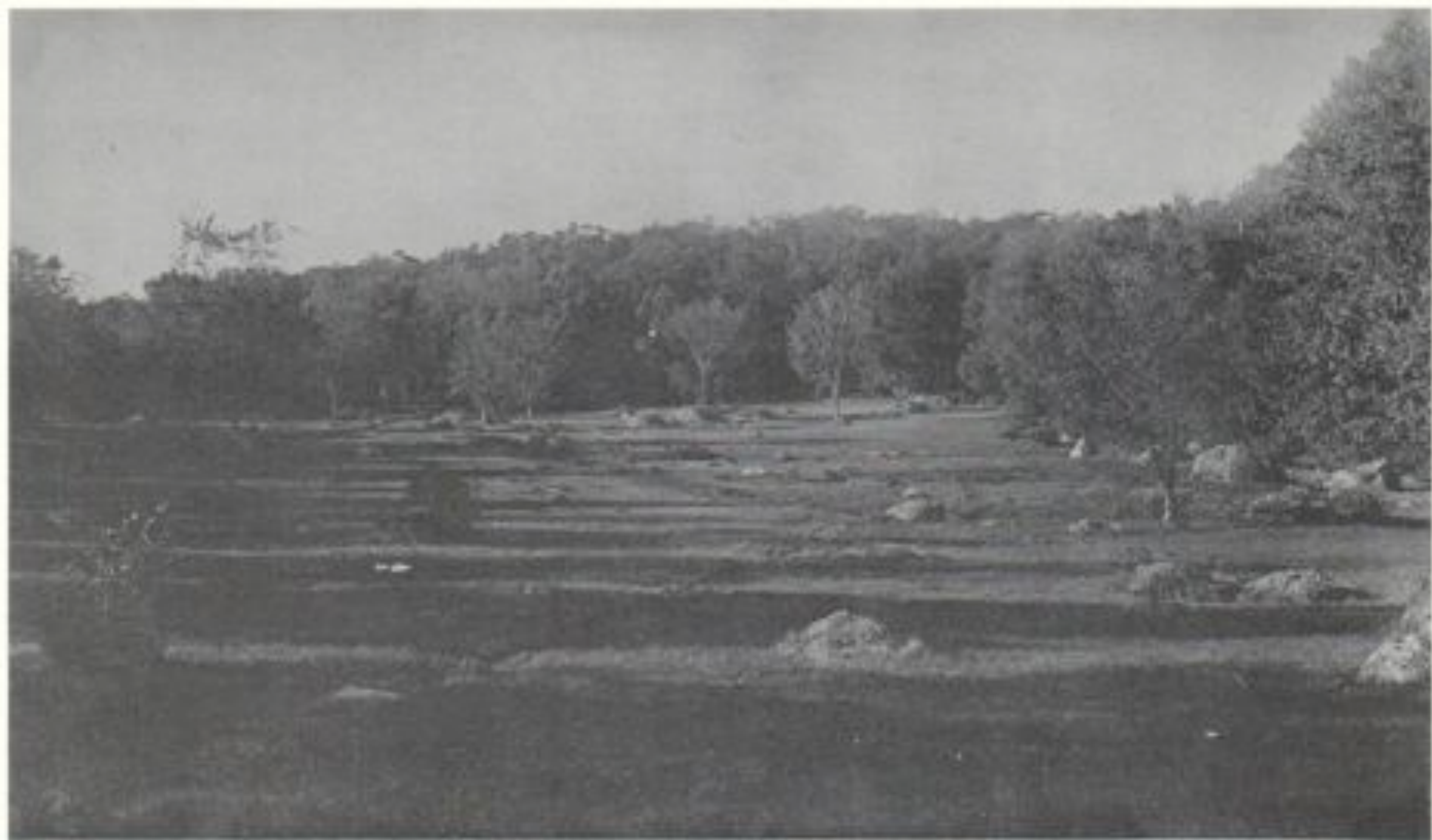
THE WILLIAMS FARM, 1884 AT THE FOOT OF SCHOOLMASTER HILL