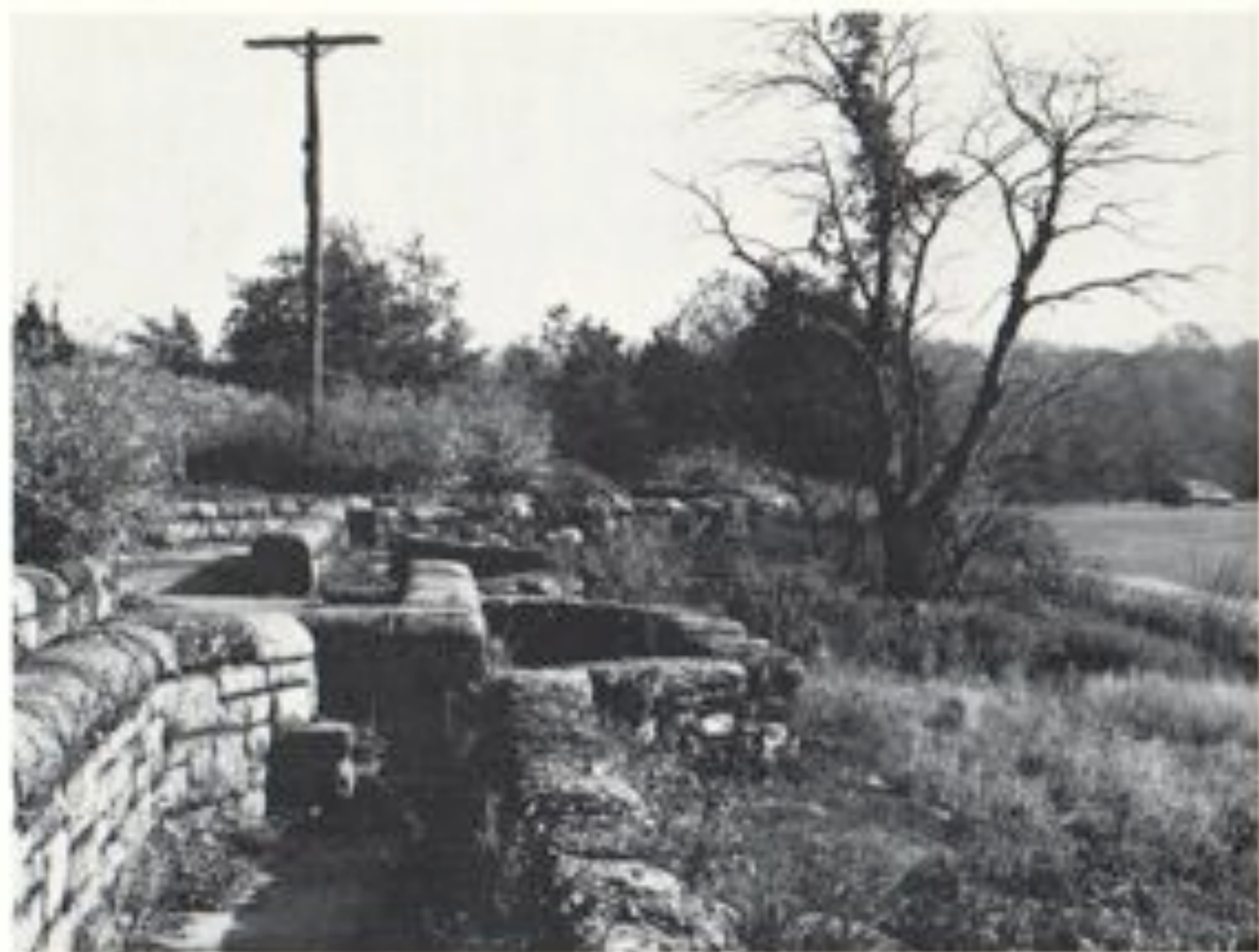
SCHOOLMASTER HILL TERRACE