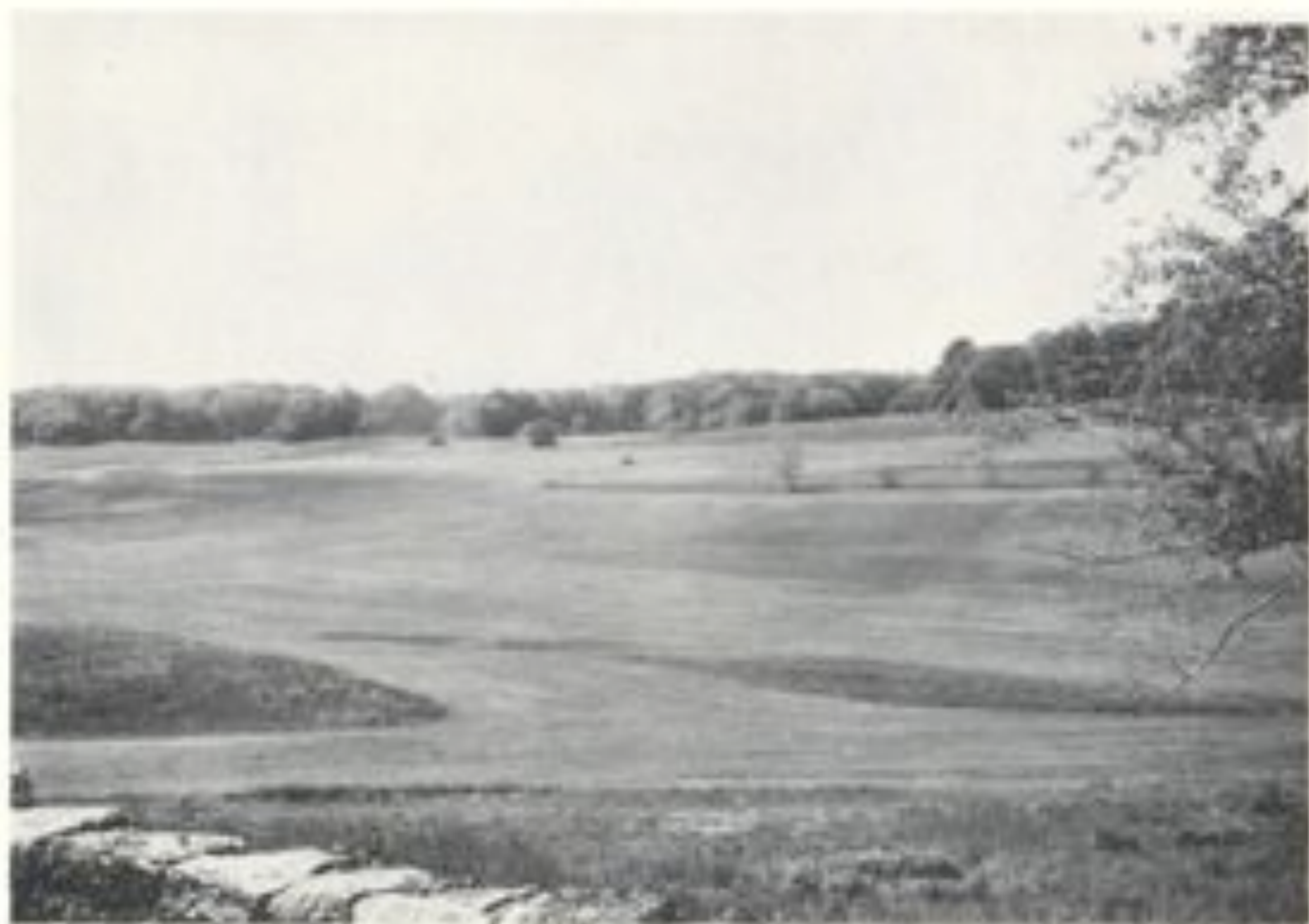
SCHOOLMASTER HILL TERRACE, WITH THE COUNTY PARK MEADOW