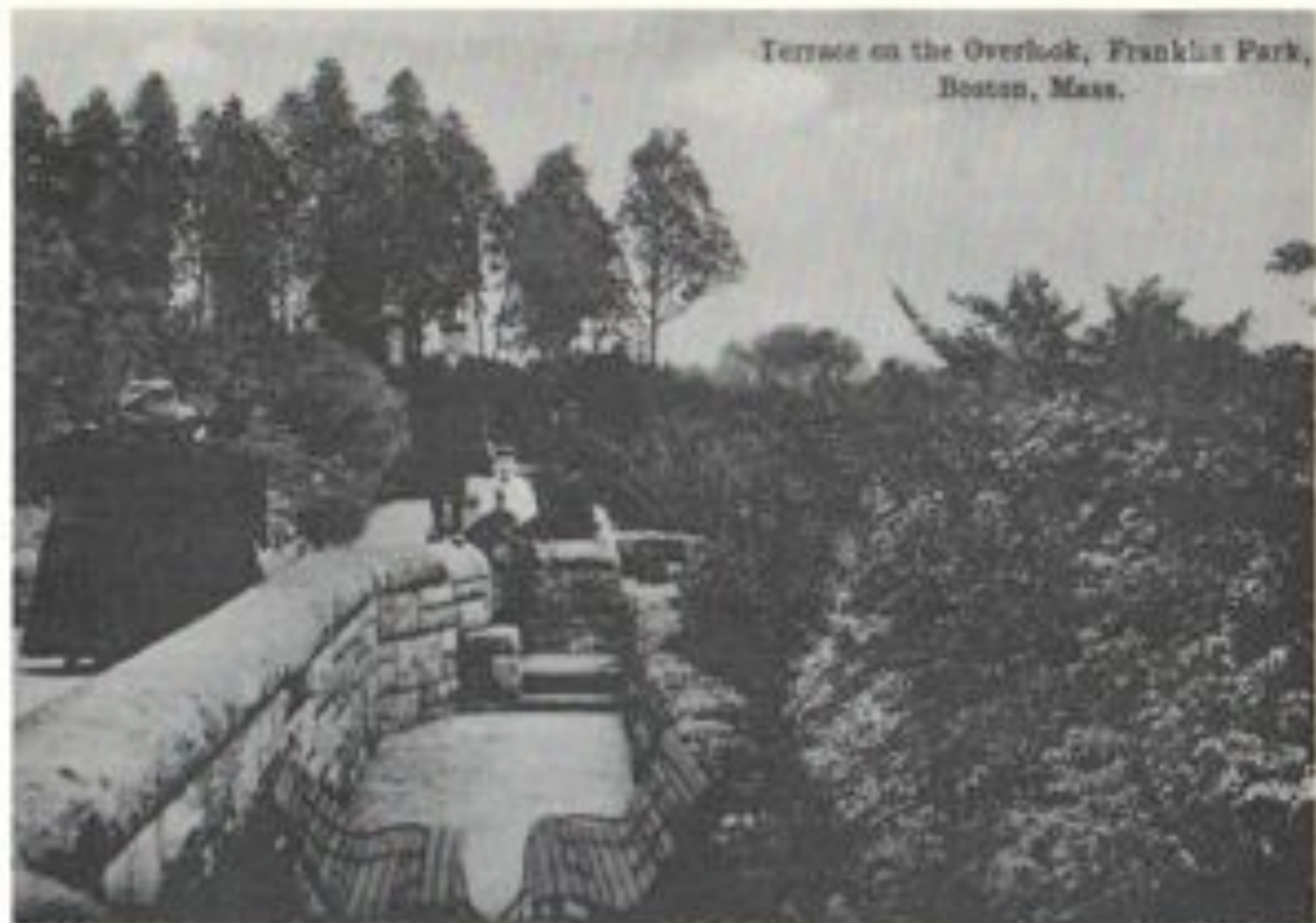
SCHOOLMASTER HILL TERRACE, FROM AN OLD POSTCARD, ABOUT 1910